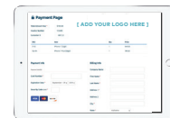
PayLynx Hosted Payment Page